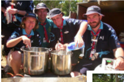
Leaders & Scouts from Troop 0608 preparing toffees for their sweet stall.