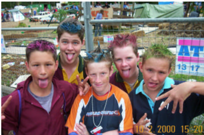
Now there's some faces only a mother could love!